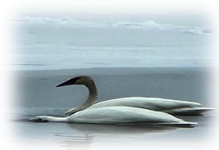
Trumpeter Swans on Deer Lake

Spoon filling over hot crust and sprinkle reserved crumbs on top. Bake at 350 degrees for about 35-40 minute. I have tried this recipe mixing rhubarb with raspberries, blueberries or a mixture of all three. Enjoy!